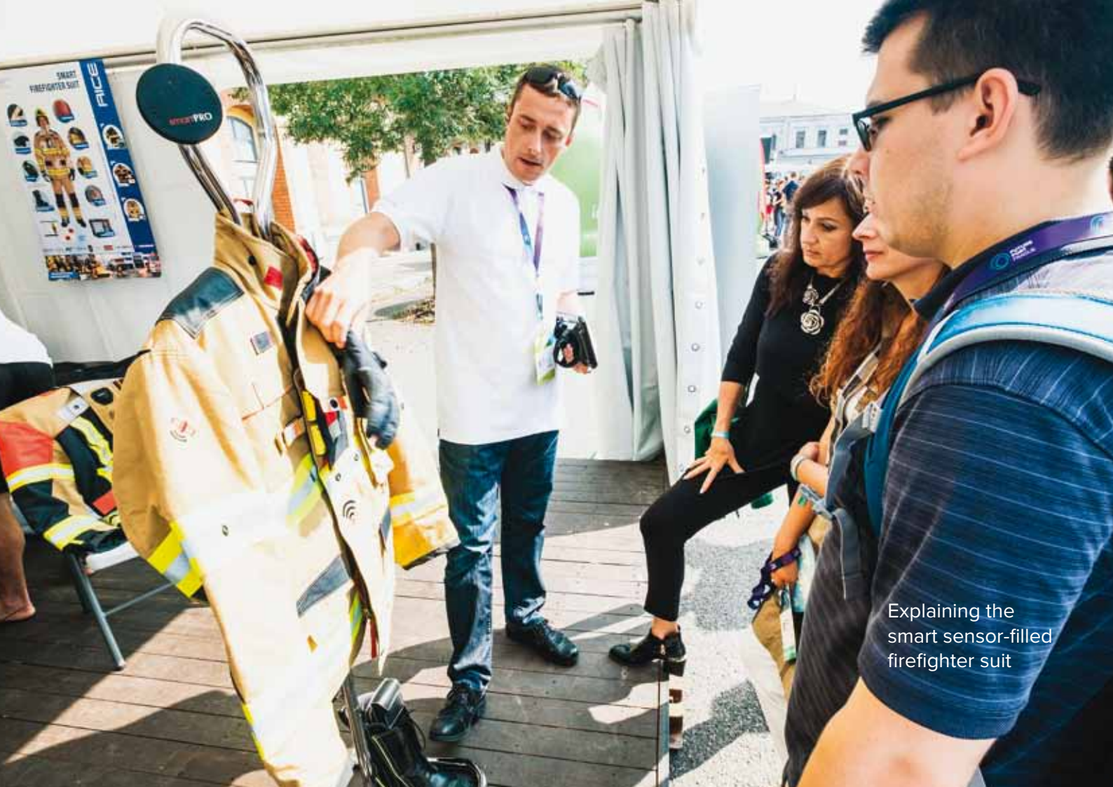
Explaining the smart sensor-filled firefighter suit