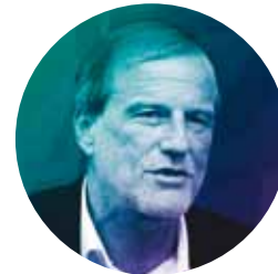
Dolfi Müller (CH) Mayor of Zug the capital of Swiss Cryptovalley