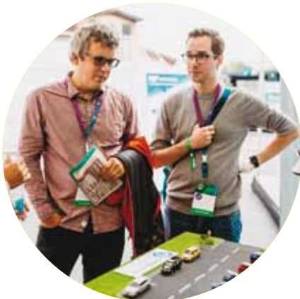
ŠKODA AUTO employees exploring newest technologies at the Future Port Festival

At the expo, the company was represented by ŠKODA Design with the futuristic concept Vision X and ŠKODA AUTO Digilab with projects like HoppyGo carsharing, and mobility as a service.