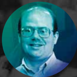
Larry Sanger Co-founder of Wikipedia, CIO Everpedia US