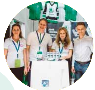
ŠKODA AUTO Team in the hiring zone

"I am definitely recommending my colleagues to join in next time".