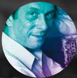
Prof. Kevin Warwick Cyborg & Researcher UK