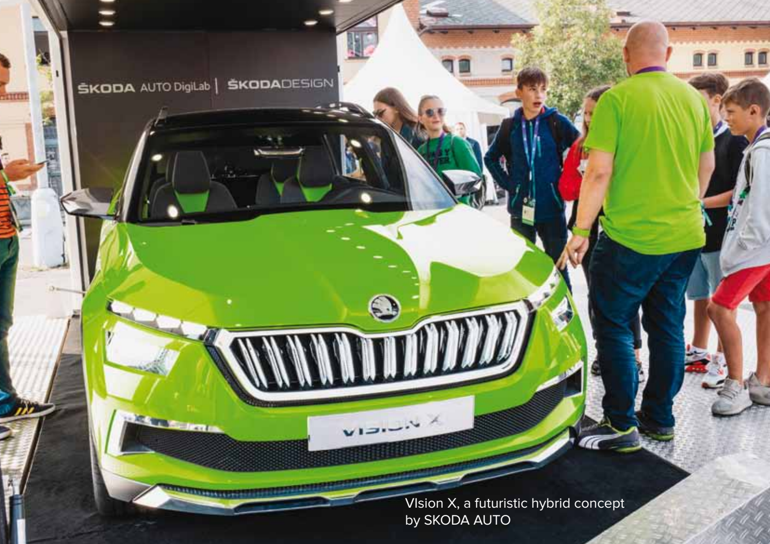
Vision X, a futuristic hybrid concept by ŠKODA AUTO