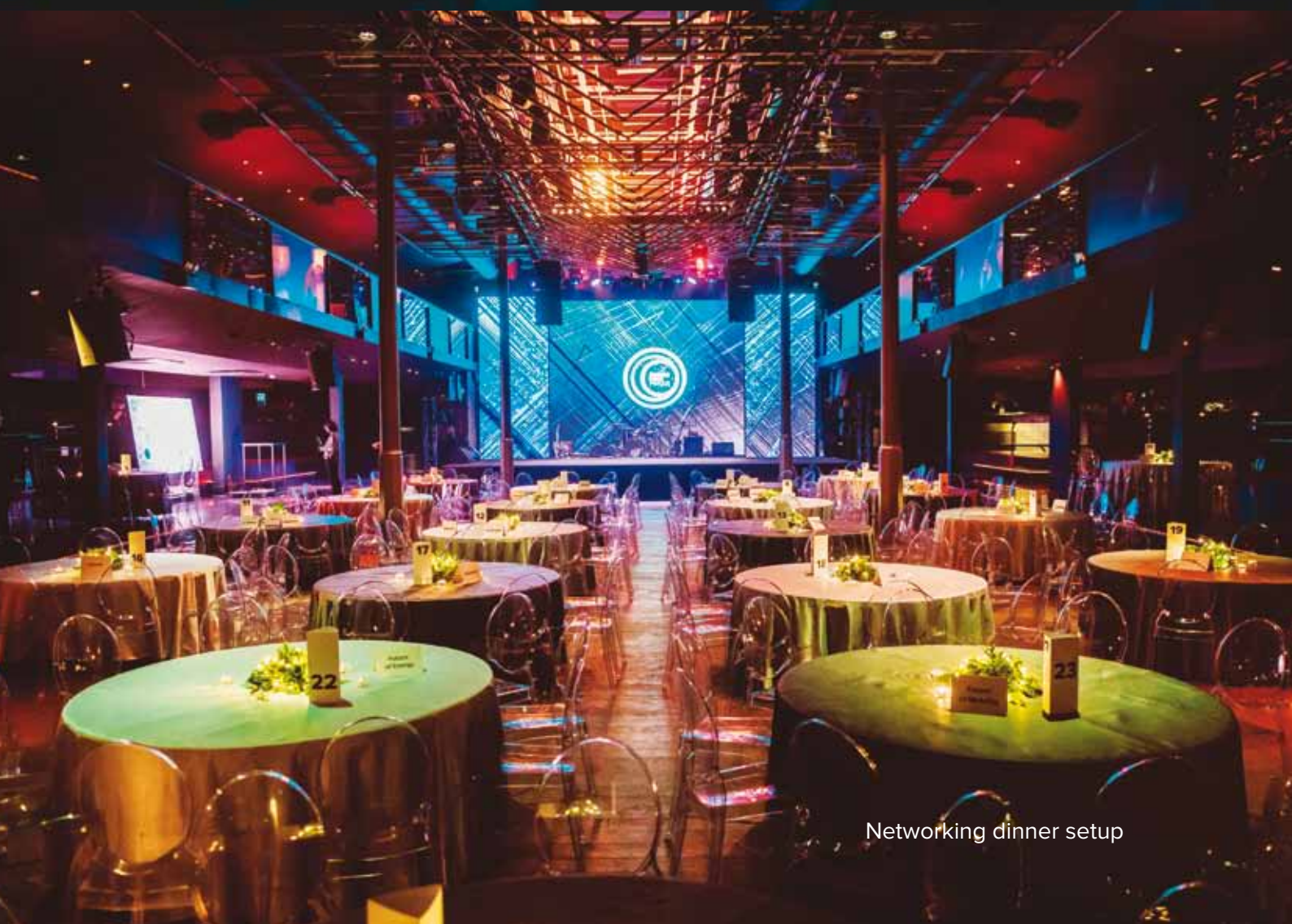
Networking dinner setup