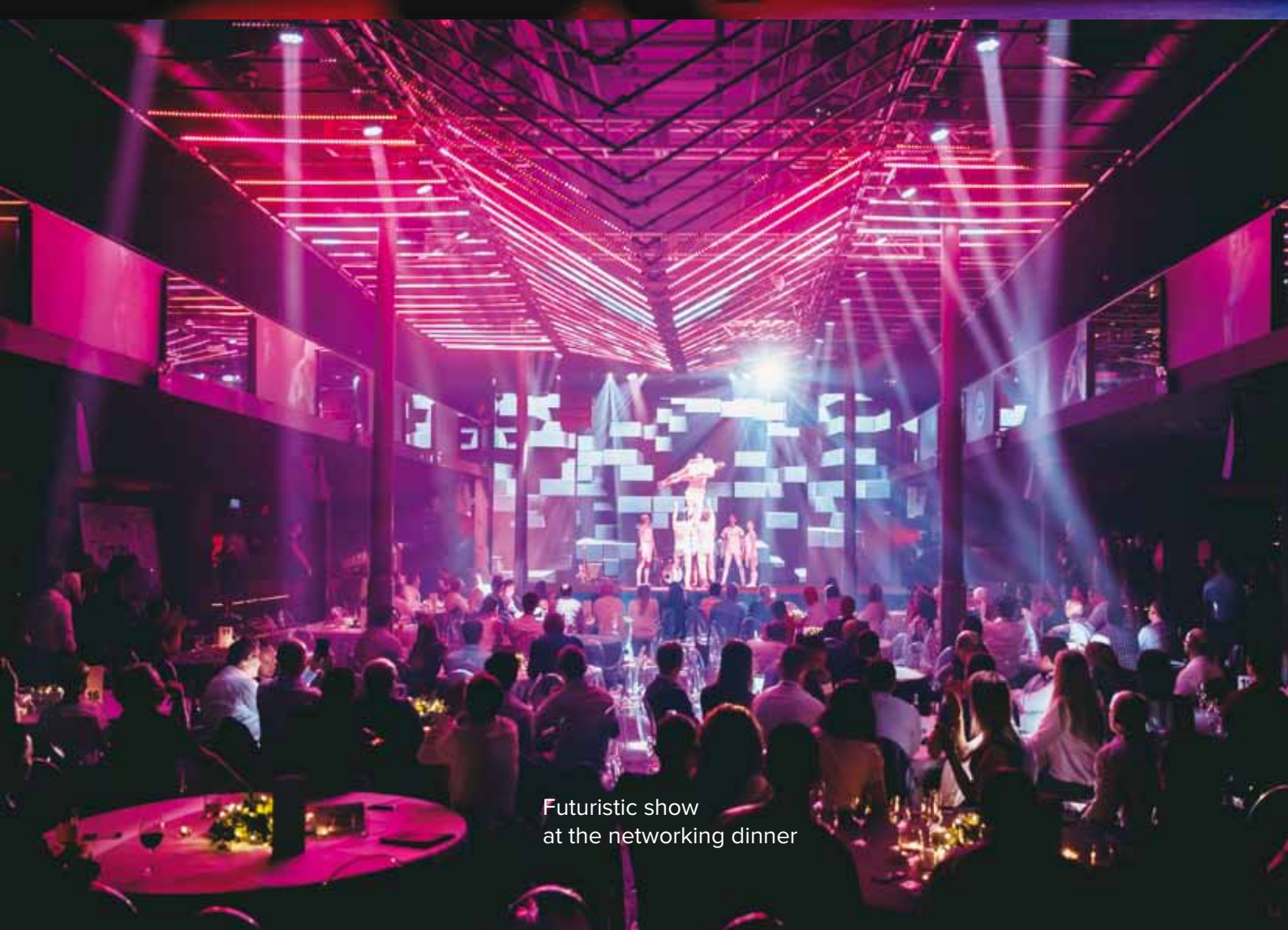
Futuristic show at the networking dinner