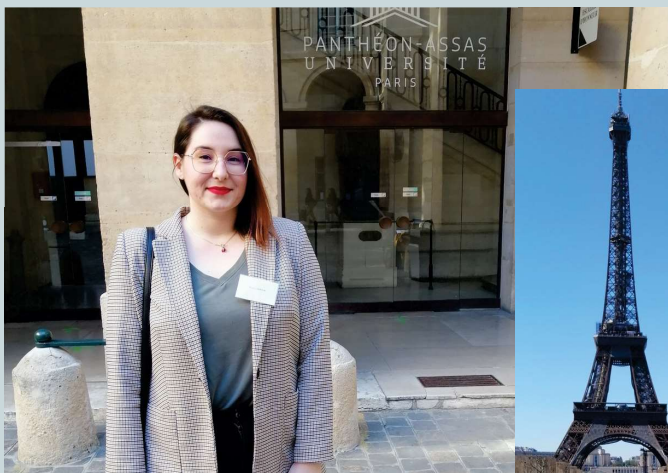
Paris, France (2023)