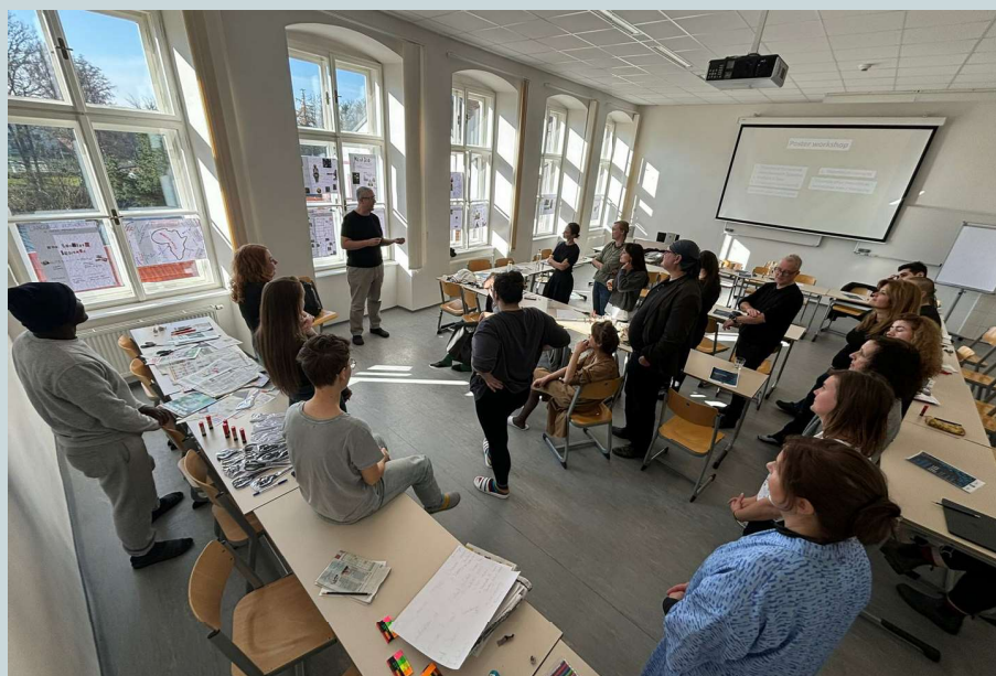
PhD get-together, Telč, 2024