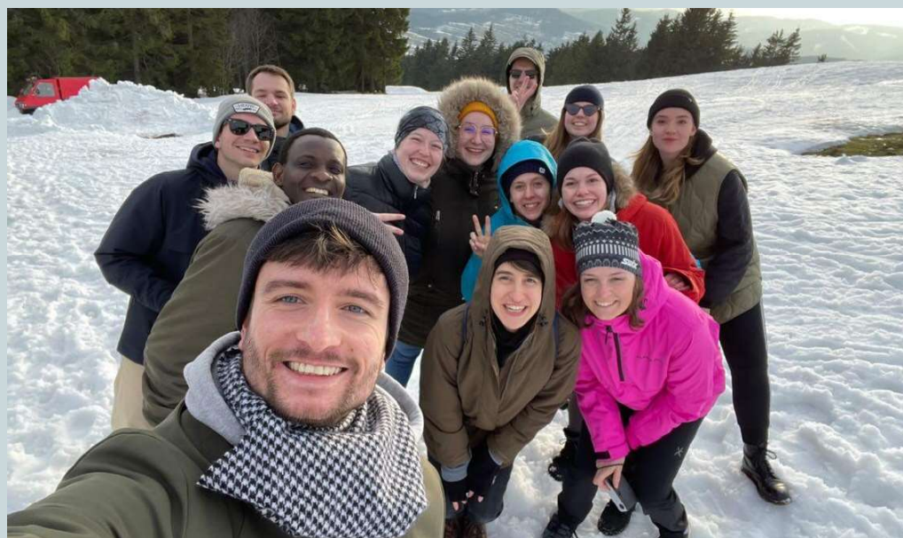
PhD get-together, Horni Rokytnice, 2023