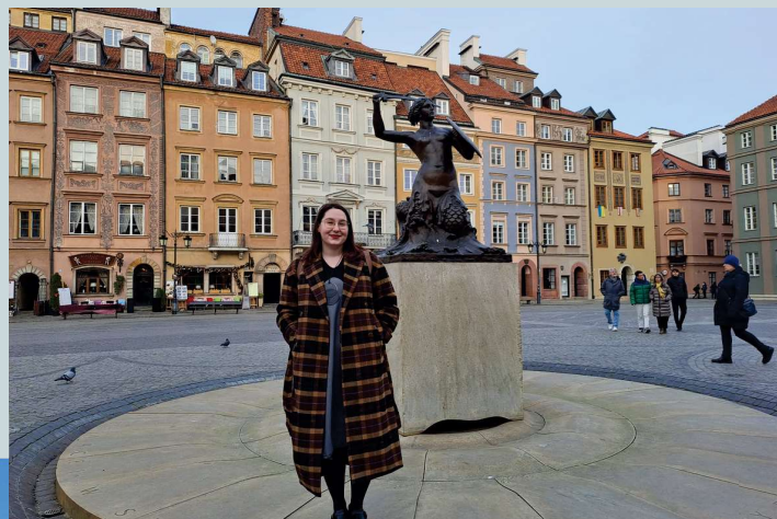
Warsaw, Poland (2024)