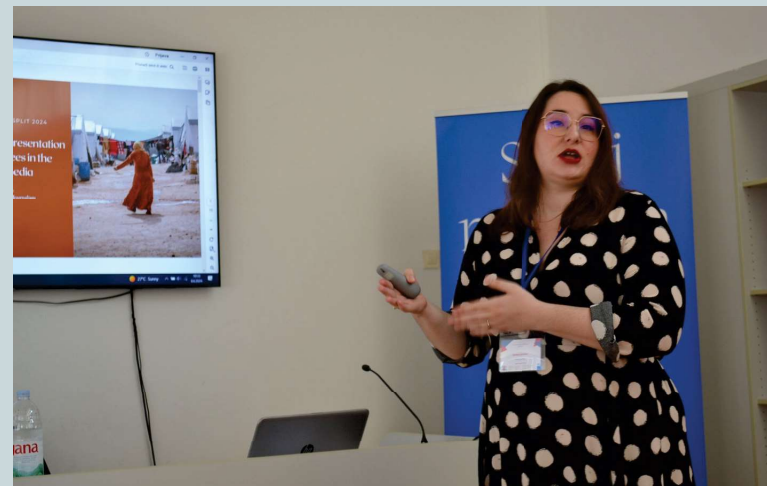
Split, Croatia (2024)