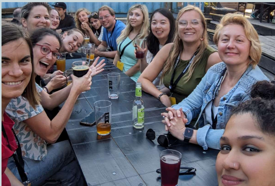
ECREA Summer School, Denmark, 2024

Networking (formal and informal) Discussing your PhD topic with other researchers Getting feedback on your research