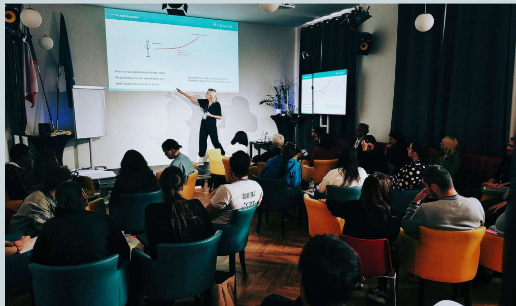
DigiTech Research Spring School, Prague, 2024