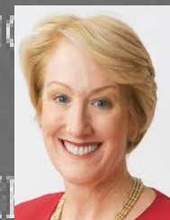
Anne Mulcahy former Chairperson and CEO of Xerox Corporation