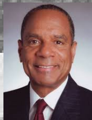
Ken Chenault former CEO and Chairman of American Express