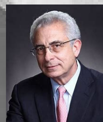
Ernesto Zedillo President of Mexico 1994-2000 Director of the Center for the Study of Globalization at Yale University