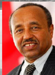
Bekele Geleta Former Sec. Gen Intern'l Federation of the Red Cross