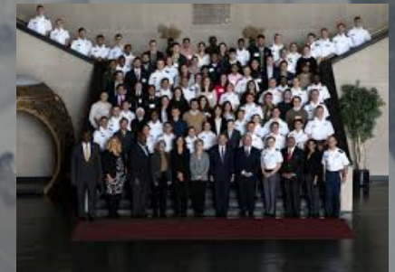
Undergraduate leaders pose with Senior Fellows and keynote speakers

THE OPEN AND HONEST DISCUSSIONS WE HAD WITH EACH OTHER AND THE SENIOR LEADERS IN ATTENDANCE WERE REFRESHING. I LEARNED A LOT FROM PEOPLE WILLING TO SHARE THEIR FAILURES AND THE LESSONS THEY LEARNED FROM THEM. IT WAS EYE OPENING THAT MANY OF US EXPERIENCE THE SAME ISSUES AND CONCERNS, REGARDLESS OF WHERE WE ARE FROM OR WHAT CAREER FIELD WE ARE GOING INTO. I ALSO KNOW THE CONNECTIONS I MADE WILL HELP ME DOWN THE ROAD.