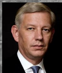
Dominick Barton Managing Director of McKinsey & Company from 2009 to 2018