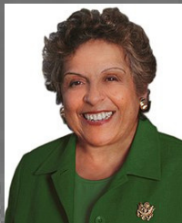
Donna Shalala Former US Secretary of Health and Human Services and former President of the Univ. of Miami