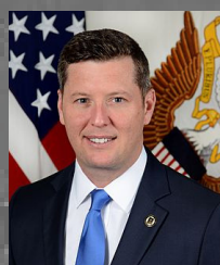
Patrick Murphy Former Congressman and former Under Secretary of the Army