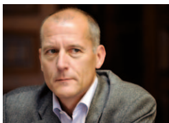
Zdeněk Tůma Institute of Economic Studies

Former Governor of the Czech National Bank.