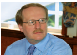
Miroslav Novák Institute of Political Studies

Former Governor of the Czech National Bank.