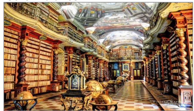
<u>Klementinum</u> – historical library located in the city center