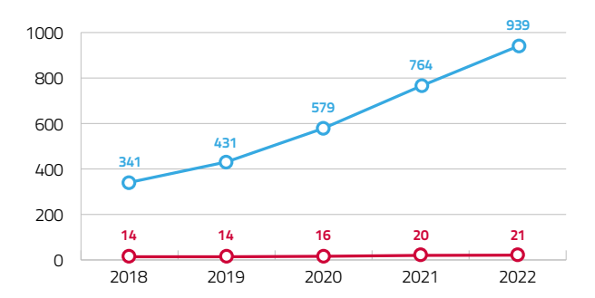
Number of students in CJSP/International degree programmes at FSV UK (study status S, U, V; always as to 1 January) Number of CJSP/International degree programmes at FSV UK (without accreditations about to expire; always as to 1 January)

FSV UK also achieved great success during this period in the form of obtaining support in the international Erasmus Mundus Joint Master Degrees program. The master's program of the European Politics and Society of the Institute of International Studies FSV UK was extended, which the faculty managed as the only one of only two institutions in the Czech Republic in the role of program coordinator. It also received support for the brand-new study program of Journalism, Media and Globalization of the Institute of Communication Studies and Journalism FSV UK, and the validity of the program of International Master in Security, Intelligence and Strategic Studies program of the Institute of Political Science FSV UK was extended. In addition to the successes in Erasmus Mundus programs, FSV UK also continued the process of developing and extending double degree and joint degree programs in existing CJSP, creating an international environment with students from more than 50 countries.